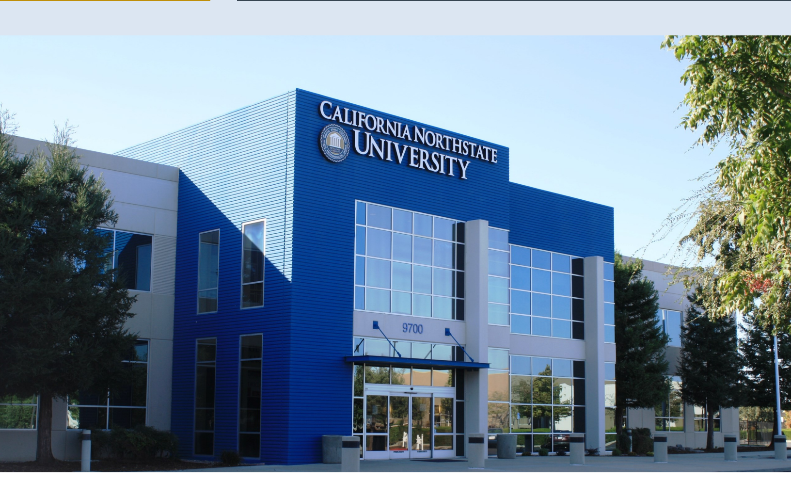
COLLEGE OF PHARMACY COLLEGE OF MEDICINE COLLEGE OF HEALTH SCIENCES